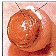
PlastiBell Ring Ligature